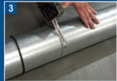
3 Use O-ring (comes with sleeve) to mark cut line. Cut.