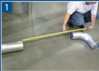
1 Measure length needed.

Now you can make the infinite adjustments to fit any length requirement. The 11" long adjustable sleeve is recommended for longer lengths, and the adjustable collar on the fittings are for the critical short adjustment between fittings.