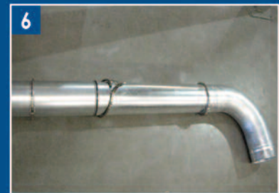
6 Clamp ends of assembly and then clamp O-ring to sleeve.