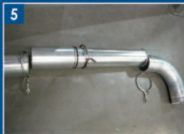
5 Adjust to length.