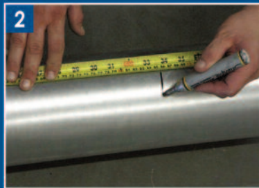
2 Mark standard 5' duct 3-4" shorter than length needed.