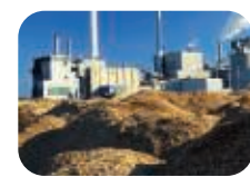
Process & Industrial