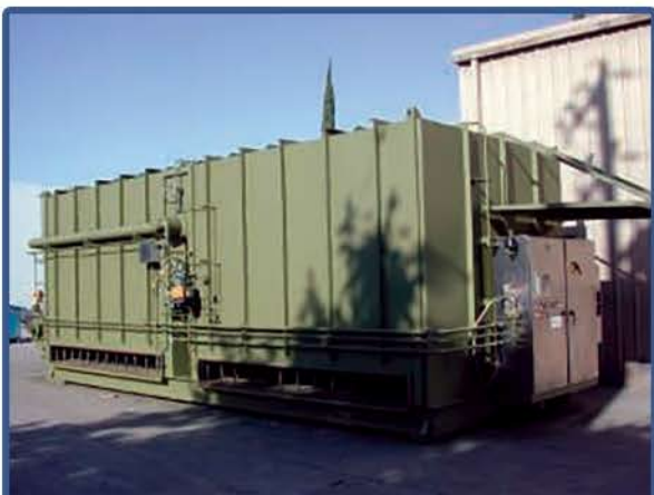
Midstream Gas Amine Treating RTO