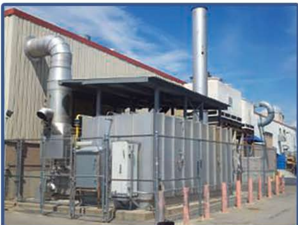
Petrochemical RTO Oxidizer