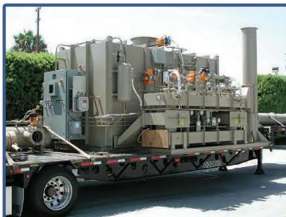
Alloy RTO for Midstream Amine Treating