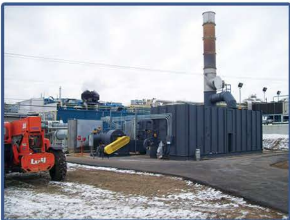
Halogenated Pharmaceutical RTO