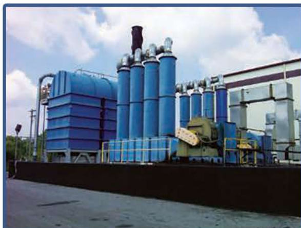
Asphalt Saturating RTO with Prefilter