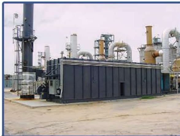
Methyl Bromide PET Chemical RTO