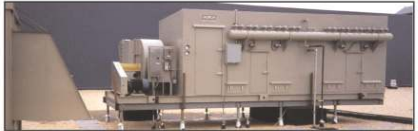
Collection of weldsmoke fume using WE-30 unit.