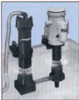
Small Infiltrator system constructed of CPVC, mounted inside tank.