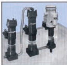
Add a carbon chamber to your existing filter system.

Dye contaminants from nickel acetate sealing solutions and crack detection liquids as well as taste, color, or odors can also be removed.