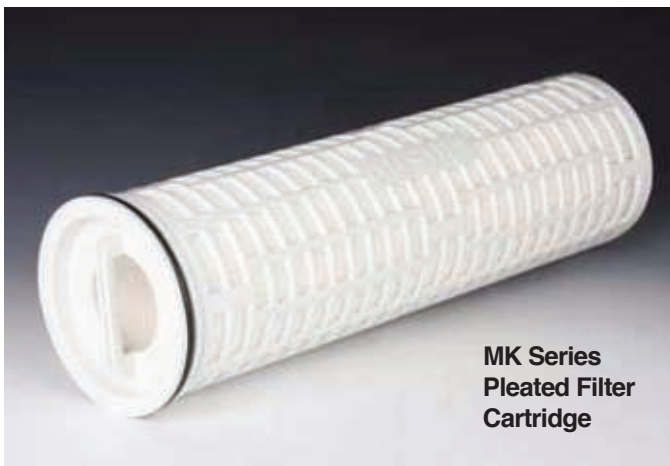
MK Series Pleated Filter Cartridge