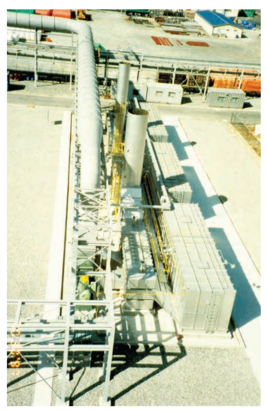
3 Module RETOX RTO System for 120,000 scfm Ethanol Chemical Processing

As illustration 1 shows, the ethanol process VOCs enter the dual chamber RTO through the fan inlet and are ducted to a zero leakage metallic poppet valve