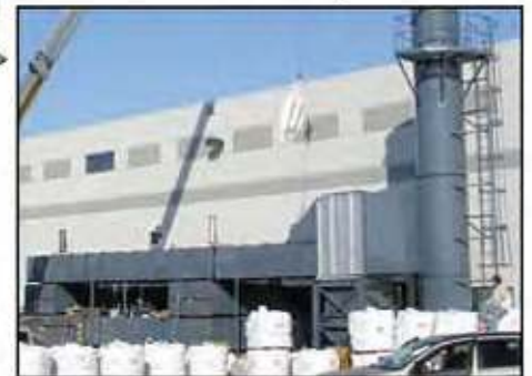
61,000 SCFM RETOX RTO with Secondary Air-to-Air HX for Styrene/EPS Packaging