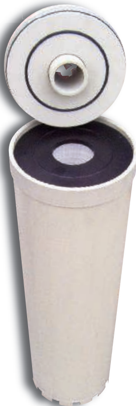
100% Sealed Housing For "High Performance 6"Ø Pleated Filter"