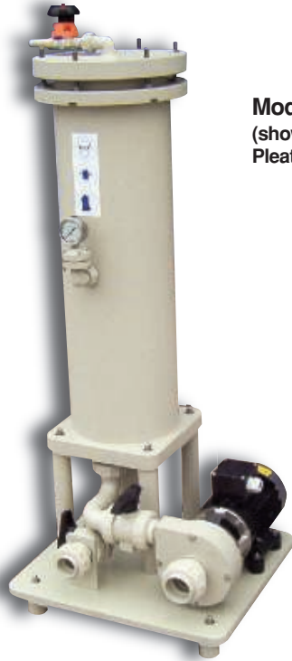
Model PL6-CRS (showing 6"Ø Pleated Element)

CORROSION RESISTANT SOLID PP CONSTRUCTION