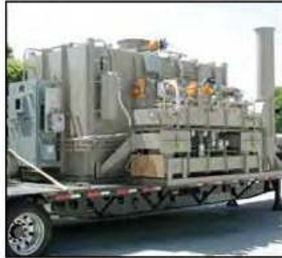
Stainless 4,000 SCFM RETOX RTO Module For Oil & Gas Amine/Dehydrating VOCs