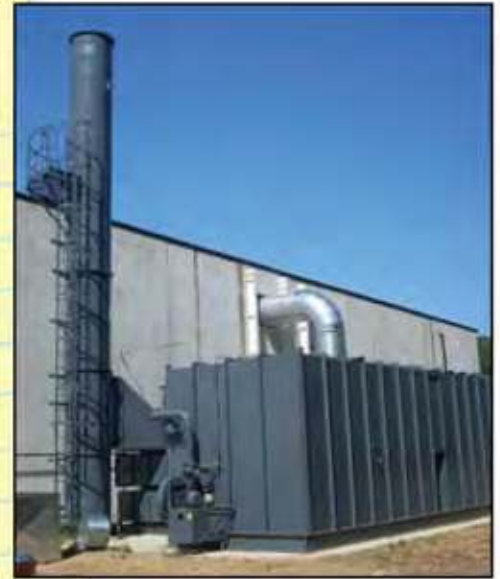
Adwest's high level of RETOX RTO shop assembly and modular design provide rapid indoor or outside installation.

THE CLEAR GREEN CHOICE IS ADWEST'S RETOX RTO!