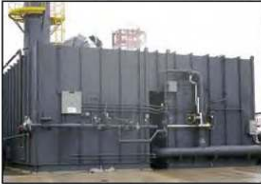
80,000 SCFM Adwest RTO for Multisource Flexographic Packaging and Printing