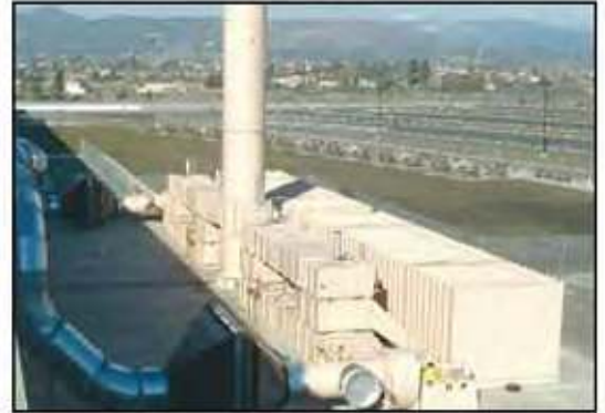
115,000 SCFM Turnkey RETOX RTO for Wood Cabinet Finishing Paint Shop, 23 Paint Booths