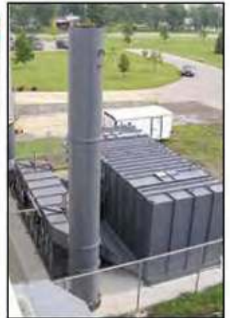
20,000 SCFM RETOX RTO Paint Spray/Roll Coating and Finishing