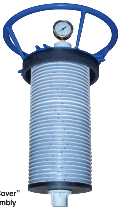
“Unitized Pack/Cover” PVDF Disc Assembly