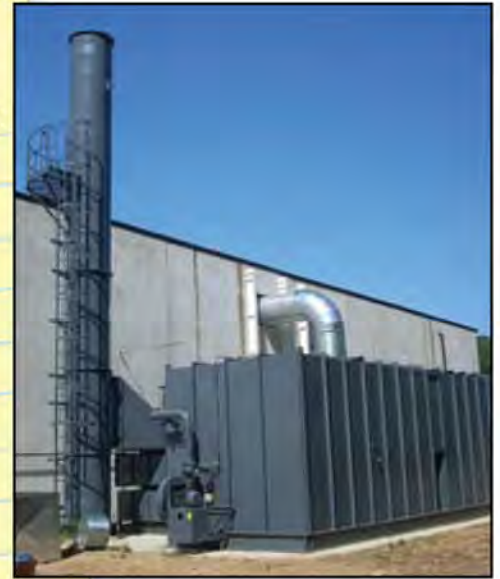
Adwest's high level of RETOX RTO shop assembly and modular design provide rapid indoor or outside installation.

THE CLEAR GREEN CHOICE IS ADWEST'S RETOX RTO!