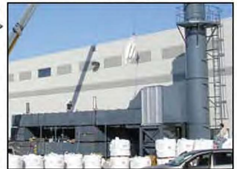
61,000 SCFM RETOX RTO with Secondary Air-to-Air HX for Styrene/EPS Packaging