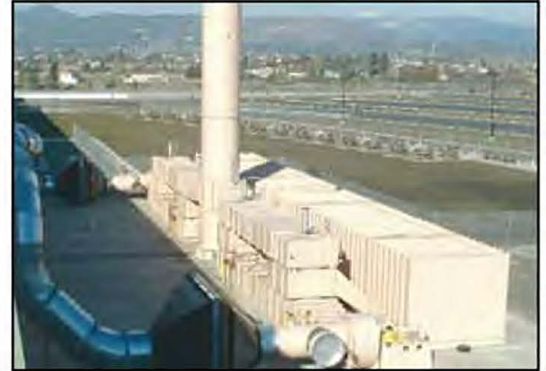
115,000 SCFM Turnkey RETOX RTO for Wood Cabinet Finishing Paint Shop, 23 Paint Booths