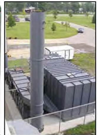
20,000 SCFM RETOX RTO Paint Spray/Roll Coating and Finishing