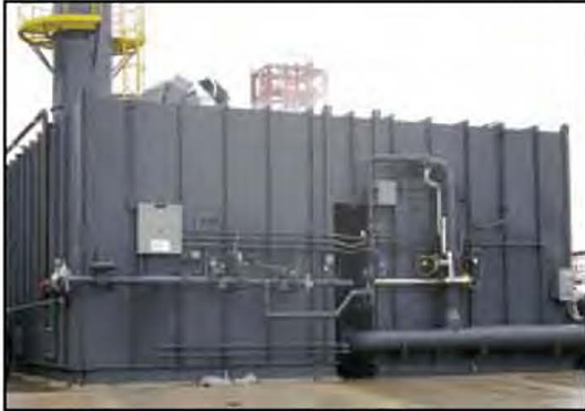
80,000 SCFM Adwest RTO for Multisource Flexographic Packaging and Printing