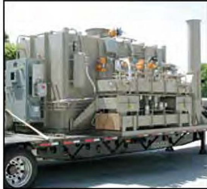
Stainless 4,000 SCFM RETOX RTO Module For Oil & Gas Amine/Dehydrating VOCs