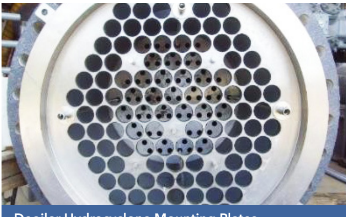
Deoiler Hydrocyclone Mounting Plates