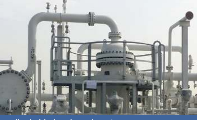
Fully-skidded Hydrocyclone System