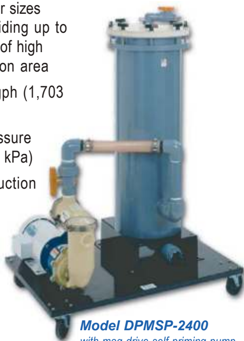
Model DPMSP-2400 with mag-drive self-priming pump