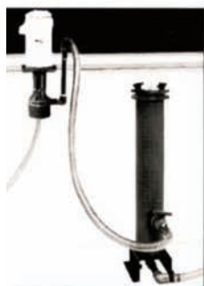
MODEL ZDD-900 WITH THREE TUBE CHAMBER

Pump mounted outside tank, chamber floor mounted outside tank