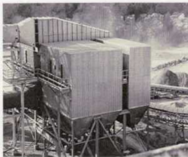
Dust Collector Systems